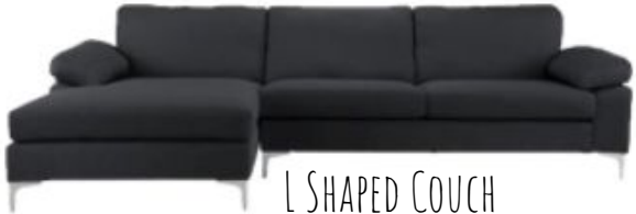
L SHAPED COUCH