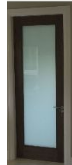
FROSTED GLASS DOOR