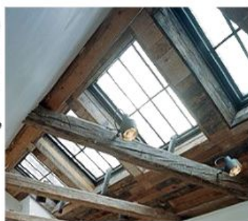
CEILING WINDOWS AMBIENT/GENERAL ALSO FOR WINDOW TREATMENT