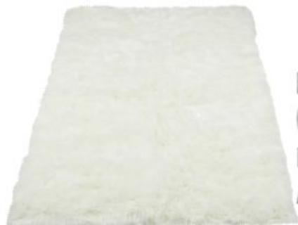
RUG (IN CASE LIGHTS DON'T WORK AS AN ACCESSORY)