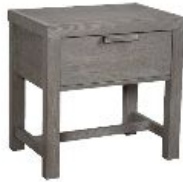
NIGHTSTAND (MURPHY TOO)