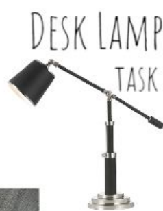
DESK LAMP TASK