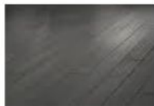
FLOORING DARK WOOD