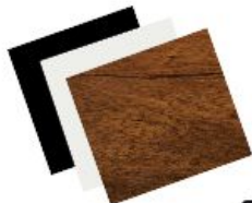
COLOR SCHEME TRIADIC/NEUTRAL