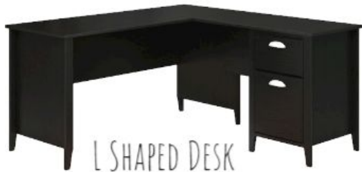
L SHAPED DESK